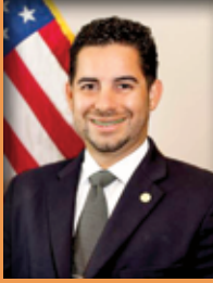
Joel Flores Mayor