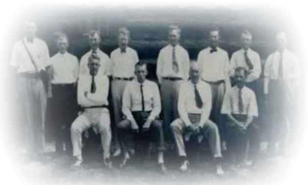
First Town Council of Greenacres City Chartered in 1926