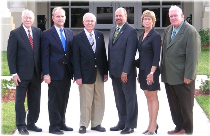
From Left: Councilman Noble, Councilman Radcliffe, Councilman Rose, Mayor Ferreri, Councilwoman Fouts, Councilman Shaw.

The following are highlights of actions taken by the City Council at their meetings, from January through July 2009.