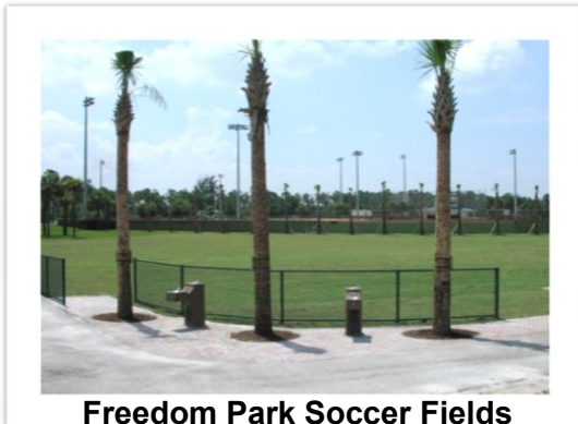
Freedom Park Soccer Fields

At Greenacres Freedom Park , soccer opportunities have been expanded through the construction of a soccer field area located on the Northeast side of the park's entrance (beyond the outfield fence of baseball field).