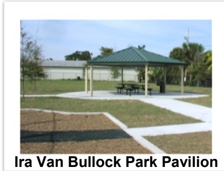
Ira Van Bullock Park Pavilion

The City has recently completed two (2) major improvements to parks in Greenacres. Work has been completed on the construction of a new playground (including a play structure and swings), gazebo, and open grassed play area at Ira Van Bullock Park (IVB).