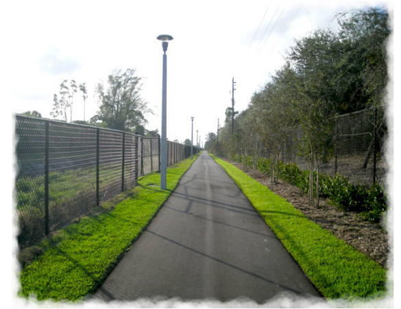
GREENACRES COMMUNITY PARK PEDESTRIAN & BICYCLE PATHWAY

With the installation of a new gate to Liberty Park Elementary School, the new pathway also provides a safe route to school for children living west and southwest of the school. The path is now open for use by the public.