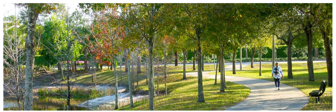
GREENACRES COMMUNITY PARK

Trees and landscaping are important to Greenacres because they enhance the quality of life for all our residents by providing shade, cleaning the air, reducing noise, reducing rainwater runoff, controlling soil erosion, and providing habitat for our native wildlife. The City Council approved revisions to the City landscape code and the following are some of the new regulations.