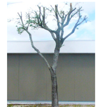
EXAMPLE OF HAT-RACKING

Invasive species: Several invasive species of plants have been introduced from outside Florida over the years that are destroying native plant habitats and endangering the existence of native wildlife that depend on the food and shelter of those habitats. The City encourages all property owners and residents to plant native vegetation and remove any of the "Prohibited Trees in All Circumstances" including Australian Pine, Brazilian Pepper, Carrotwood, Earleaf Acacia, Melaleuca and Scheffelara.