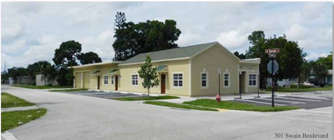
301 Swain Boulevard